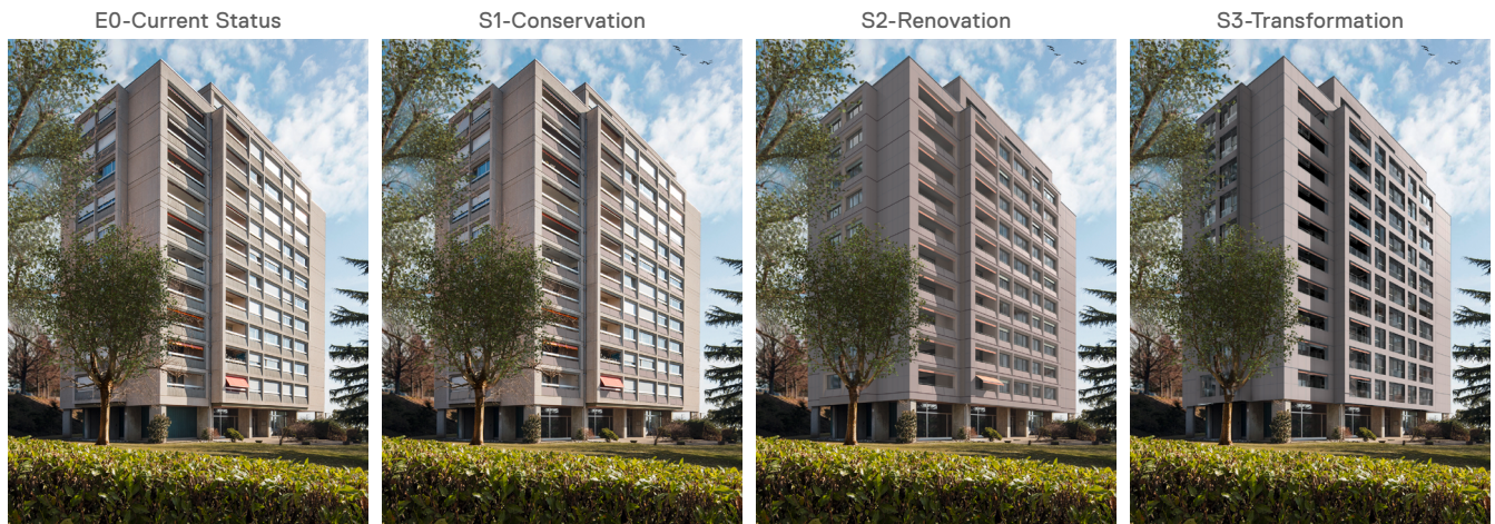
Fig. 2 Example of BIPV renovation scenarios proposed according to design and energy performance objectives [1] (©EPFL-LAST).

S1-Conservation: This scenario aims to maintain the substance or expression of the building when possible (considering current practices) while improving its energy performance, by replacing defective elements with better performing ones: for instance, by changing windows, internal wall insulation and roof insulation. The highest performance is not necessarily achieved, because we want to respect the existing appearance of the building, but current legal requirements [2] should at least be achieved. In addition, unlike the baseline (S0, current practice), in this scenario (S1) we propose to respect the targets needed to obtain a subsidy of 60 CHF/m 2 from the "programme bâtiment" [3] which promotes energy renovation of existing building envelopes.